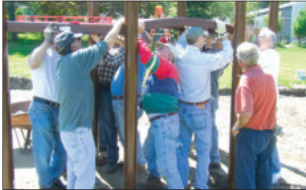
Johnson Park located in Empire Village, was the recipient of a "Playscape" addition last summer thanks to funding — and manpower — provided by the Empire Lions Club.

The Empire Village Council meets at 7:00 p.m. on the second Thursday and fourth Tuesday of each month in the Township Hall.