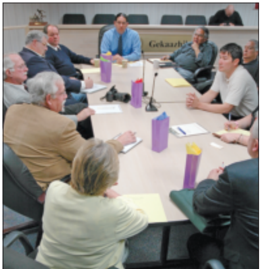
Members of the County Board of Commissioners and the Tribal Council of Grand Traverse Band of Ottawa and Chippewa Indians held a joint meeting last year to discuss common points of interest. The two boards had yet to schedule a joint meeting in 2012 when the Leelanau Pages went to press.

And remember that the government center is closed for holidays, including Martin Luther King Day and Columbus Day.